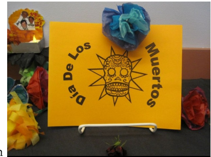
Our colorful Día de los Muertos shrine created by the WMST interns.

The Brown Bag series is a Center staple, but this semester it has undergone many interesting adaptations from previous years. For a few years, there has been a trend towards more collaboration with other departments and organizations, evident yet again in this semester's great diversity of topics. Similarly, Brown Bags made greater use of panels than before, integrating more voices into presentations. Another intriguing development this semester was the expansion of the Brown Bag form. In celebration of Día de Los Muertos, the Brown Bag featured poetry readings followed by a day of activities associated with Día de Los Muertos. The last Brown Bag of the term took place in a Ryan studio as we took a look at gendered dance moves. This series never fails to entertain and to educate, even as it adapts to the community's interests, as evidenced by the record attendance.