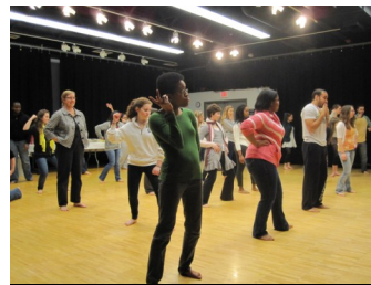
Striking hypermasculine and hyper-feminine poses at the "Body Talk" BB.