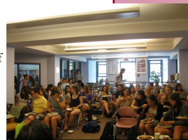
The Center is bustling every Tuesday at 11:30am for the Brown Bag Series.