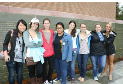
Students pose in front of the Declaration of Sentiments waterfall.

An aspect of the Seward family that stood out to me was that William Seward's youngest daughter, Fannie, kept a red leather diary that she wrote in daily. It documented the day-to-day happenings of the family and many gendered roles were highlighted in it. The Seward's had many female and male servants working in their house, and the wife and daughters did more activities in and around the home compared to the husband and sons, who did more traveling and business-related activities. However, the fact that the Seward women possessed such impressive writing skills and educational opportunities was remarkable for their time period and speaks to the fact that they were a very privileged family. If Fannie Seward had not kept this diary, much about the Seward's family history would not be known today. This trip demonstrated what a profound historical impact women had of which I was unaware prior to participating!