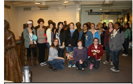
Participants inside Women's Rights National Historical Park.

We also went to tour the homes of Elizabeth Cady Stanton, Harriet Tubman, and William Seward. Visiting all of the houses was very informative and the different styles and sizes of the three homes showed much about how people of different socio-economic classes lived during the 1800s. Elizabeth Cady Stanton's home was a fair-sized two-story structure near a river in which she and her family lived. Harriet Tubman's home was much more secluded and smaller, even though it housed many more people who would stay with her as they traveled along the Underground Railroad. William Seward, the Secretary of State to President Lincoln and the purchaser of Alaska, had the largest and most elaborately decorated of the three homes. Its location was also right in the center of town, but it was somewhat gated off, which illustrates how Seward probably wanted a balance between his public and private life. The home was beautifully furnished with exquisite furniture and artwork. Additionally, Seward was an abolitionist and a very liberal and modern politician for his time; his home was a stop along the Underground Railroad, and many travelers stayed in his basement before departing to head north to Canada where African Americans gained freedom.