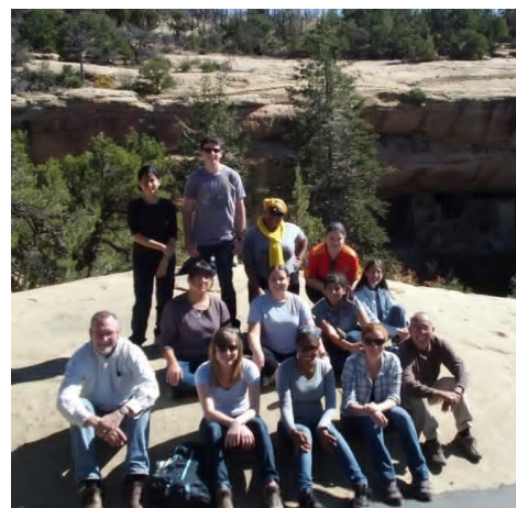
Members of the Santa Fe Study Group pose at Mesa Verde in Colorado.