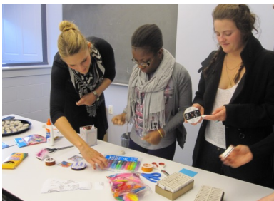
At the Día de los Muertos BB, students and staff enjoy decorating skulls and matchboxes.