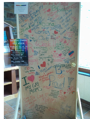
The Coming Out door is on display in the Coop for people to sign.

Thank you to all who participated in celebrating National Coming Out Day!