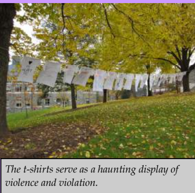
The t-shirts serve as a haunting display of violence and violation.

This fall the Center for Women's Studies once again participated in the Clothesline Project. The Clothesline Project aims to break the silence surrounding the issues of intimate partner violence and other violations by literally bringing personal experience into the foreground of communities. The Center for Women's Studies provided materials for students and staff to make t-shirts with messages that speak out against the violence or that share personal experiences, and for a week these t-shirts were hung on clotheslines in the Center, as well as across outdoor spaces on campus. It is a striking project that clearly gets its message across: we will not be silent until the violence stops.