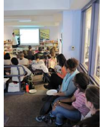
Students gather at one of the weekly brown bags.

For the “regulars,” the first Tuesday of the semester was a return to a beloved tradition that had been on hiatus for the summer: the Women’s Studies brown bag series. For new students and students new to Women’s Studies or feminist thought, it marked the beginning of discussion on campus about diverse topics affecting people across the sex and gender spectrums as gendered and sexed beings. As people throughout the Colgate community sat (or stood, depending on the popularity of the brown bag ) to eat their Curtain Call food, discussion blossomed around issues of sexualization, transnationalism, diversity, intimacy, and many others. Collaboration with other departments and services provided interesting intersections worth being brought to people’s attention. As the semester closes, the promise of a continuing conversation around these topics ensures the series’ place in Colgate tradition.