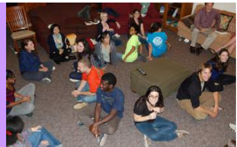
Students share their ideas through an interactive exercise during the last session of the seminar.

In order to honestly and critically address issues of sexuality and gender on this campus – or our infamous hookup culture – Colgate students need to start somewhere. Whether they knew a little or a lot, were experienced or neophytes, loved or hated the hookup...everyone had something to contribute to Yes Means Yes , which enriched the quality of the series. For most, this seminar was the first collegiate venue where it was acceptable for students to speak freely about sexual pressures or ask questions of gender identity; however, if Yes Means Yes taught them anything, it hopefully will not be the last discussion of positive sexuality at Colgate.