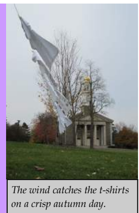
The wind catches the t-shirts on a crisp autumn day.