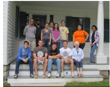
Another group of 13 gathers for a photo outside of Elizabeth Cady Stanton's home.

Overall, the trip was fantastic. To see our group, full of young, fresh individuals and to see how people do have the ability to change our lives was so empowering. I know everyone left with a sense of encouragement and the confirmed belief that we can do anything.