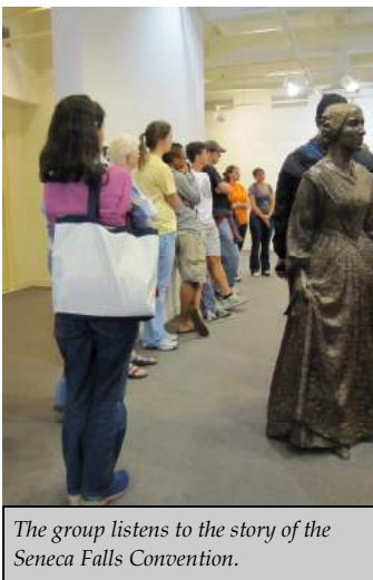
The group listens to the story of the Seneca Falls Convention.

During the trip, we saw so many historical places: the Seward House, Harriet Tubman's estate, and the Women's Rights National Historical Park. Had someone told me that central New York had such rich history, I wouldn't have believed them. Here it is, such monumental figures and places integrated within the heart of the country - right in our own backyard!