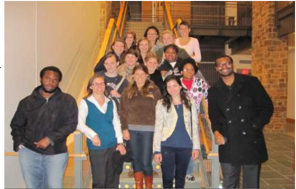
The group enjoys their visit to Hamilton College for the well-attended Guyland lecture.