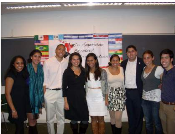
Members of LASO pose with Patti Solis Doyle after a dynamic keynote lecture in honor of Hispanic Heritage Month.

As the first Hispanic woman to lead a major U.S. presidential campaign, Patti Solis Doyle exemplifies the strength of the Latino community. On October 14 Solis Doyle spoke of her personal journey growing up in Chicago and her path to politics. First as a White House assistant in the Clinton Administration and then as campaign manager for Hillary Rodham Clinton in 2008, Solis Doyle shared her experiences of working in politics. Throughout her political career, Solis Doyle has stressed the importance of self-worth. She proves that persistence and strong values are key components to professional and personal success. Students in attendance pressed Solis Doyle for her opinions on the Obama Administration and the forthcoming midterm elections. With