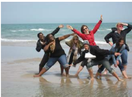
Part of the group enjoys time at Skagen Beach.