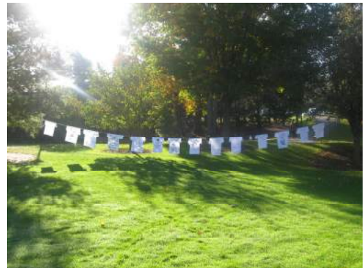
Strung between trees on the quad are t-shirts decorated with messages against sexual abuse and domestic violence.

The Clothesline Project is a national awareness-raising initiative. Anyone was welcome to paint messages on white t-shirts to convey their experiences with sexual violence and the experiences of those they know who have experienced sexual violence and to express solidarity with victims. The shirts were then hung up on a clothesline.