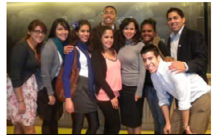
Rosie Perez poses for a picture with several members of LASO.

The crowd was unequivocally receptive to Perez’s message: Do not doubt your ability to accomplish great things. That night, as the lecture came to a close, the attendees did not step out of Olin Hall; they stepped, as Rosie said, out “into [their] greatness.”