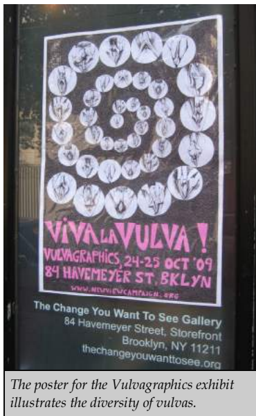
The poster for the Vulvagraphics exhibit illustrates the diversity of vulvas.

As we left the gallery, exhilarated over what we had just witnessed and heard, I bought a "Love Your Vulva" pin which now resides proudly on my backpack. After all, if we don't love our own vulvas, who will?