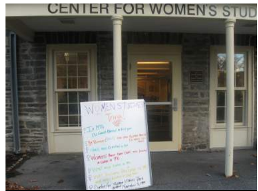
A sign outside the Center gives trivia about Women's Studies and coeducation to passers-by.

The discussion of the program and the Center's history not only conveyed the challenges that women professors on campus faced as they instituted the program but also provided inspiration for the students listening as the women described how they organized to overcome institutional challenges. Lastly, brown bag attendees were left with a renewed sense of pride in and appreciation for both the Women's Studies Program and the Center as they heard the experiences of those who fought for both and were garnered with a sense of awe at the accomplishment that the program and the Center's continued thriving represents.