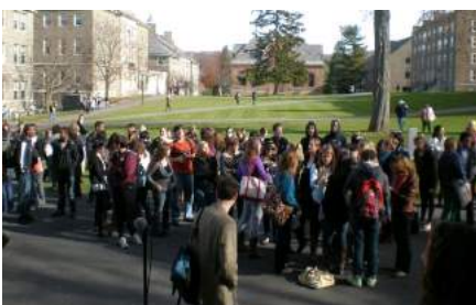
A crowd gathers for the speak out. Many stayed in the cold for the entire 2.5 hour event.