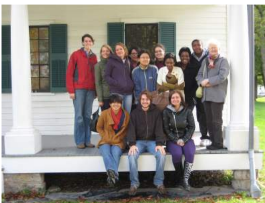
The group quickly poses for a photo outside Elizabeth Cady Stanton's home. They will soon play with chestnuts.