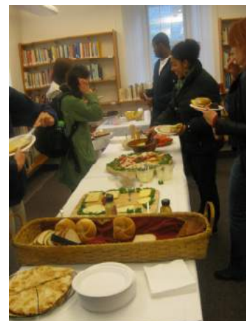
Attendees grab a quick bite before the start of a brown bag.

Members of WRIT 242 - Stand & Speak: Feminist Rhetorics & Social Change