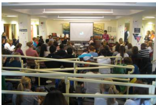
At the most popular brown bag of the semester, attendees listen to a presentation on sexual misconduct at Colgate.