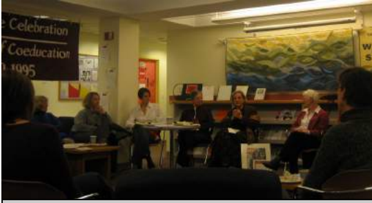
At the brown bag in celebration of the Center's 15th anniversary, WMST faculty share stories from the past.